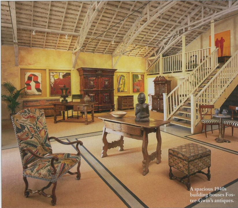
A spacious 1940s building houses Foster-Gwin's antiques.

Our Editors Present Designers' Favorite Sources